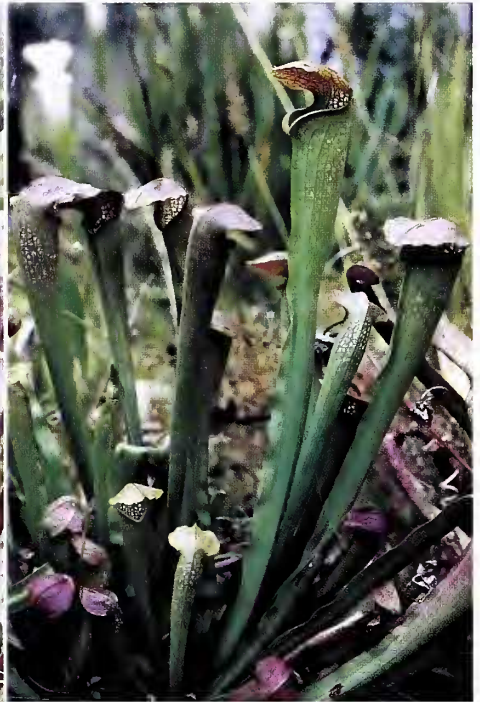
Figure 4: Sarracenia 'Hummer's Okee Classic'